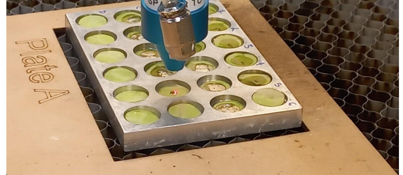
Isotope ratio mass spectrometry for determining insect origins.