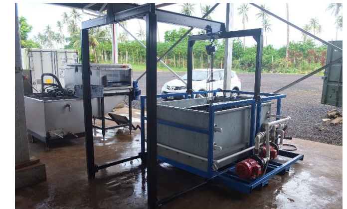
High-pressure washing and hot water treatment equipment used to treat taro for control of biosecurity pests to export to New Zealand, or to control leaf blight for export to Australia.

As a result of the project, Samoa's largest produce importer has purchased a combined HPW+HWT system, which will need to be approved by importing country regulators.