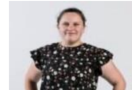
Summer Studentship supported by B3 through PFR's Te Rito programme.