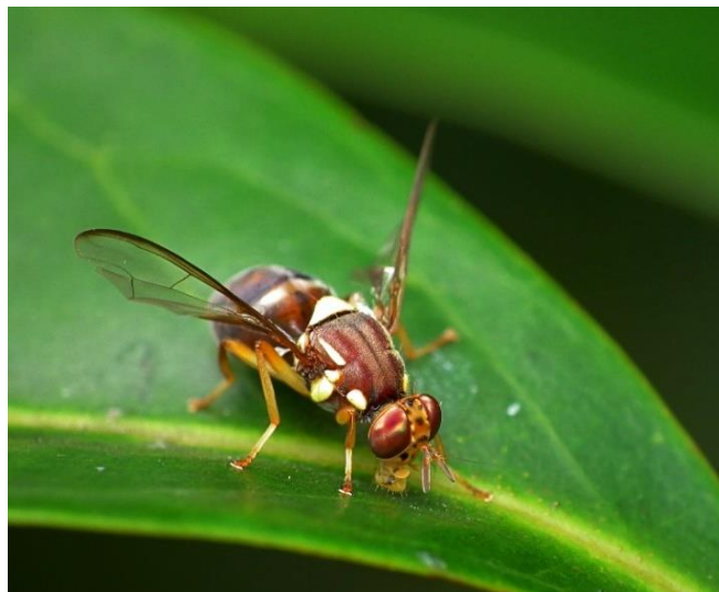
Queensland fruit fly, Bactrocera tryoni , is an example of a high-risk pest insect to New Zealand. If it were to establish, it could jeopardise our multi-billion-dollar horticulture industry.