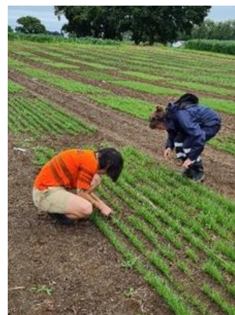
Survival differences to different herbicides were investigated between seed lots sourced from New Zealand and other exporting countries.

A three-year project ending in 2024 focuses on risks of imported herbicide-resistant seeds to develop new border