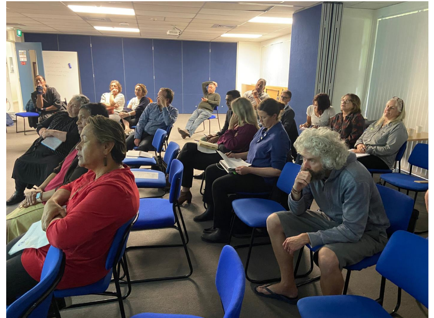
Mana Whenua hui, Tāmaki Makaurau, October 2023.

The concept of biosecurity is not new to tangata whenua, it is deeply rooted in the cultural practices and role they have as kaitiaki of their lands and