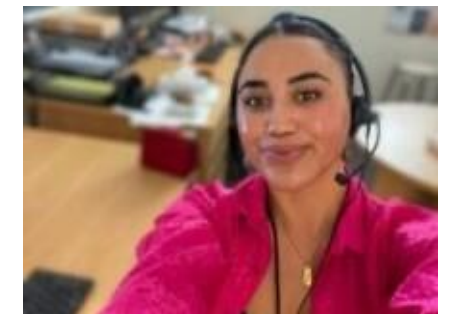
Summer Studentship supported by B3 through PFR's Te Rito programme.

Stacey developed a template to more rapidly evaluate the potential of new phytosanitary treatments for commodity items at the border. This will help narrow the list of potential treatments for New Zealand's biosecurity system and contribute to the search for alternatives to ozone-depleting fumigants and improve existing treatments.