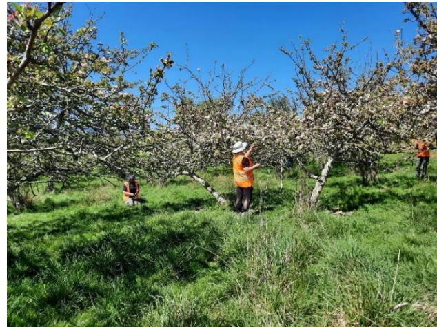
Searching for leafroller hosts of Dolichogenidea tasmanica in an abandoned apple orchard, Tasman.

A key focus of Theme A is supporting agencies such as the Environmental Protection Authority (EPA) and Department of Conservation (DOC) with evidence to determine risk, reduce uncertainty in decision-making and more confidently predict the environmental safety of new organisms for biological control.