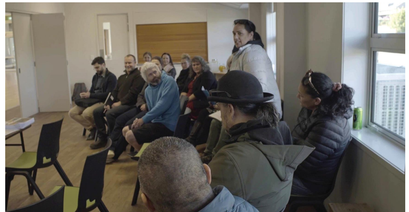
EPA, B3, BMSB Wānanga at Te Whare Wānanga o Awanuiarangi, Auckland, 26 October 2023.

Get more details about current and completed Theme A projects at B3.nz .