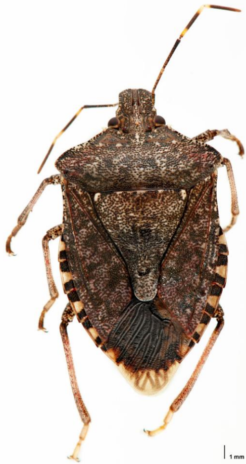
The brown marmorated stink bug, Halyomorpha halys , is an example of a high-risk pest insect to New Zealand. If diapausing individuals on pathways to New Zealand are more likely to survive than their non-diapausing counterparts, this could increase the risk of future establishment of that species in New Zealand.

The journey of high-risk pest insects in diapause, or suspended development, is being simulated to better understand the biosecurity risks of this natural phenomenon.