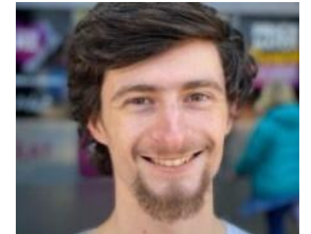
Summer Studentship supported by the Christchurch Botanic Gardens.