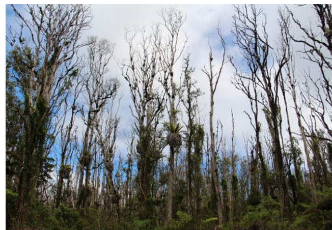
Rapid 'ōhi'a death in Hawaii.

A three-year project is assessing susceptibility of Aotearoa New Zealand Metrosideros species, such as pōhutukawa, to ROD pathogens by mapping climate risk and identifying pathways and potential disease vectors.