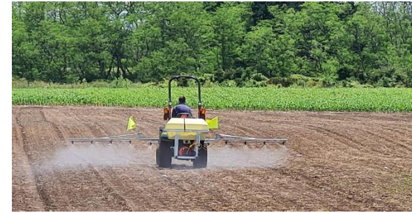
Commercial ryegrass plots were treated to identify resistance to common herbicides haloxyfop, iodosulfuron and glyphosate.

biosecurity measures or voluntary seed industry mitigation measures.