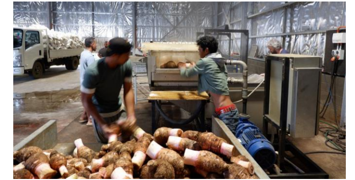
Taro being high pressure washed prior to hot water immersion – an environmentally friendly alternative to fumigation.

taro access to Australia. Support from the Pacific Horticultural and Agricultural Market Access Plus program (PHAMA Plus, funded by DFAT in Australia and MFAT in New Zealand) subsequently enabled the successful testing of this combination treatment using PFR semi-commercial treatment facilities in Samoa. Ten successful export consignments of combination-treated taro from Samoa to New Zealand resulted in no fumigation required in New Zealand (most consignments usually require fumigation). A submission was tabled with Biosecurity Australia to consider reopening the fresh taro market from Samoa.