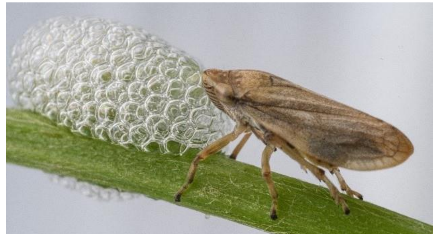
Spittlebugs may spread the unwanted pathogen Xylella fastidiosa if it enters New Zealand.

Get more details about current and completed Theme B projects at B3.nz.