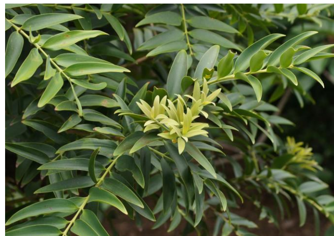
Pests and diseases of Fiji's Agathis macrophylla could threaten NZ kauri.

The project, completed in mid-2023, filled knowledge gaps on forest pests and pathogens present in the Pacific and their potential impact on culturally, environmentally, and economically valued plants.