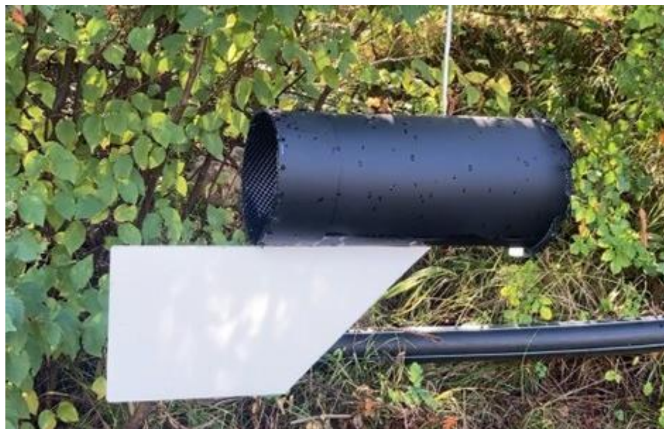
A 150-mm diameter, 30-cm long tunnel trap prototype in the field for capture of brown marmorated stink bug.