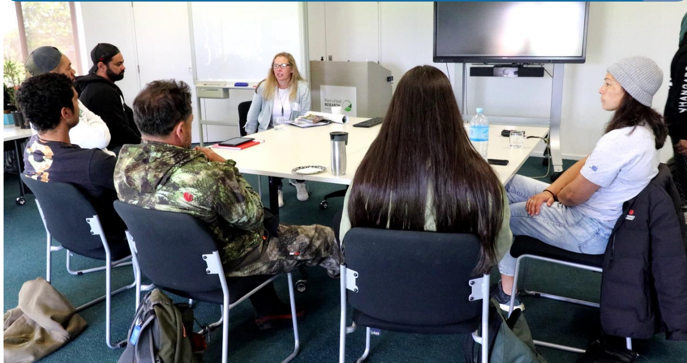
A key focus of the new Māori strategy is continuity of relationships with mana whenua across the motu. Here B3 is supporting training in species and disease identification of myrtle rust for Tauranga Moana kaitiaki.

The B3 Māori Strategy has three Pou based on the principles of Te Tiriti o Waitangi.