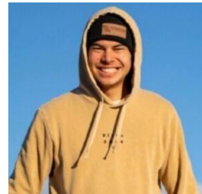
Summer Studentship supported by PFR's Te Rito programme and MPI.