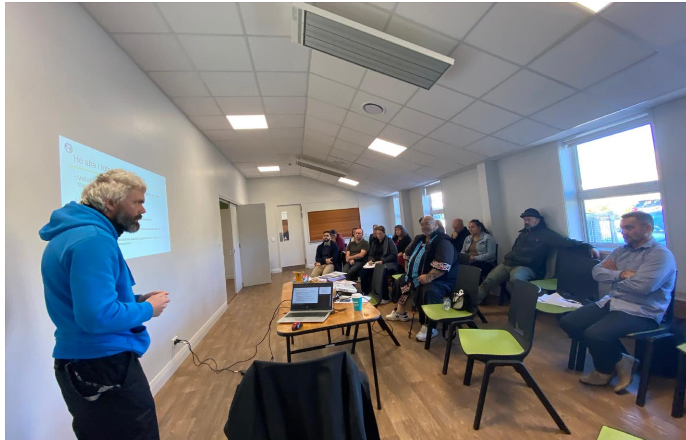
Information sharing hui with Mana Whenua in Tauranga July 2023.

Projects that relate to all parts of border biosecurity activity, and those with a focus on mātauranga Māori.